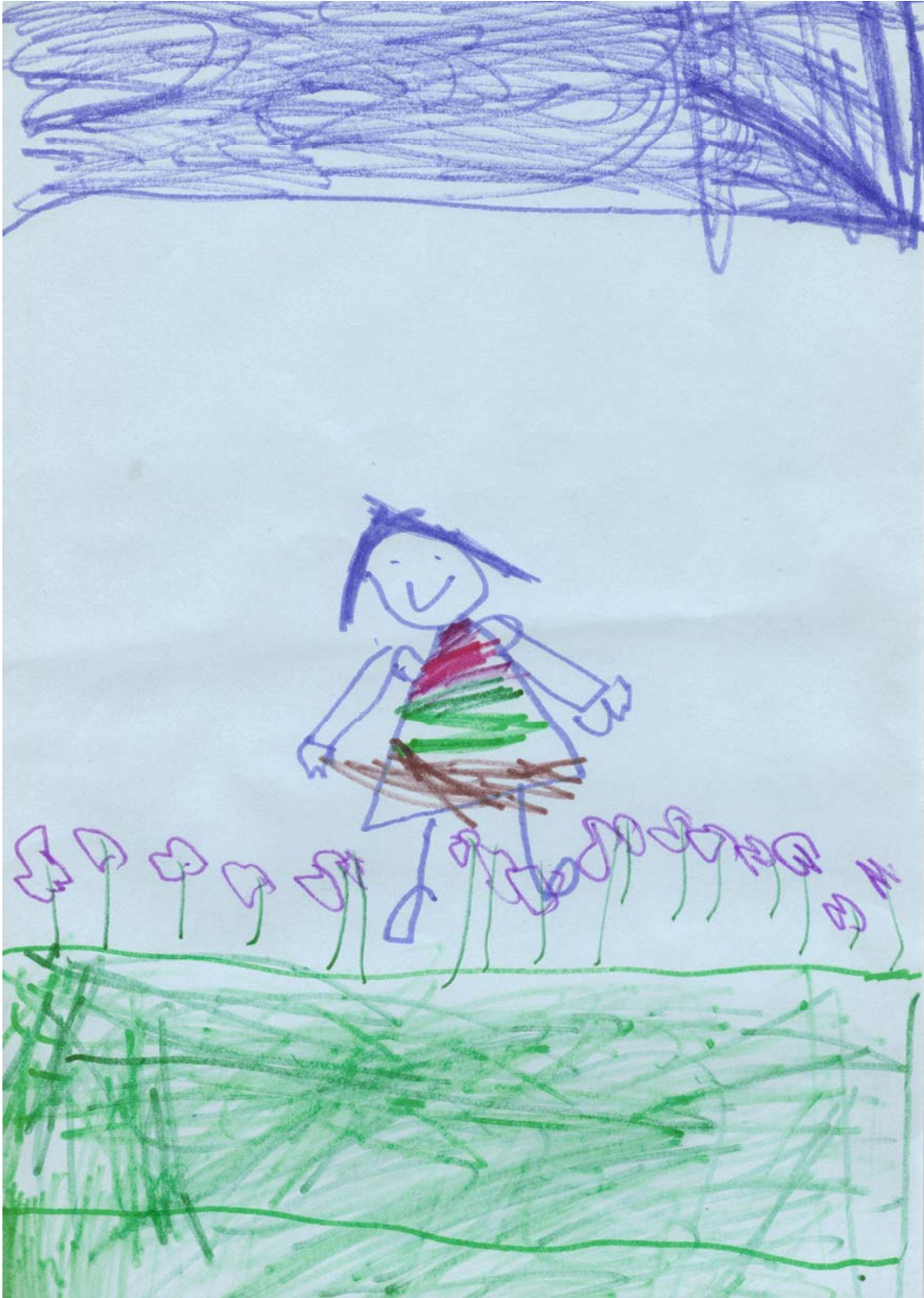
by Carys Lytle (still aged five years)